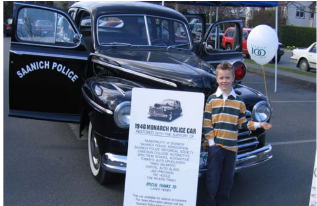
A young community association member takes a break from playing with the siren in the Saanich historic police car.

To contribute to the community's awareness of safety enhancements, Saanich Emergency Services, including the Fire Department, Block Watch, and other groups, provided information to Heritage Tea attendees.