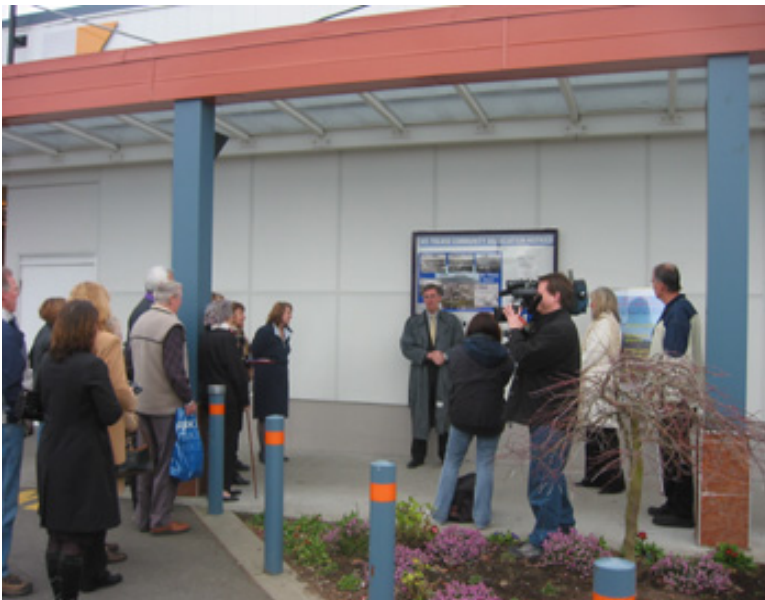
Mt. Tolmie Community Association Board at the unveiling ceremony, February 21.